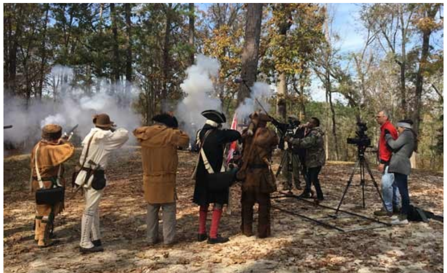
Members of the award-winning Georgia Society SAR Color Guard and Elijah Clarke Militia filming on top of War Hill.