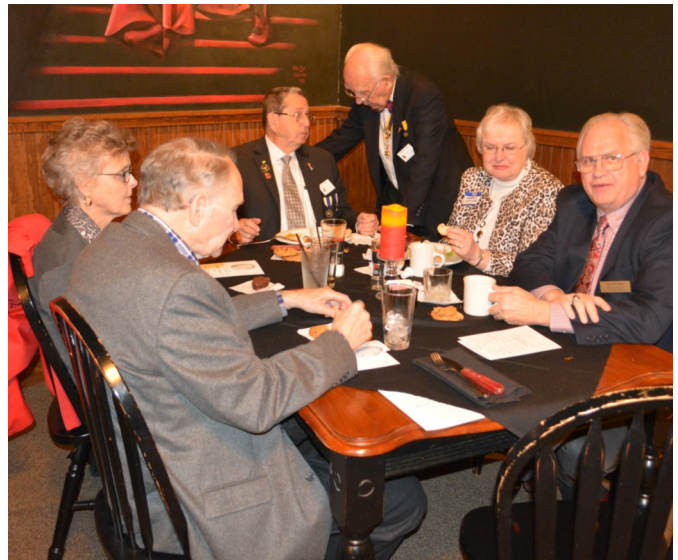
Above: Members & Guests enjoying the fellowship of the Second Annual Dinner Meeting of the Robert Forsyth Chapter of the Sons of the American Revolution