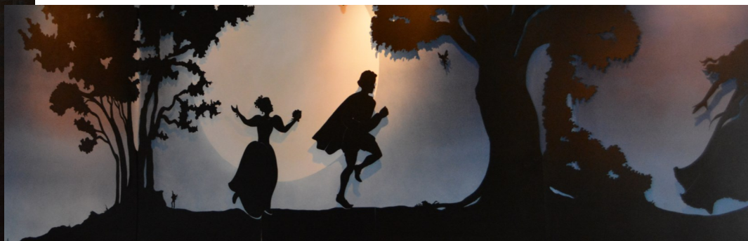
Below: Cumming Public School Building's Banquet Rooms were decorated in theatrical themes of A Midsummer's Night Dream and Phantom of the Opera .