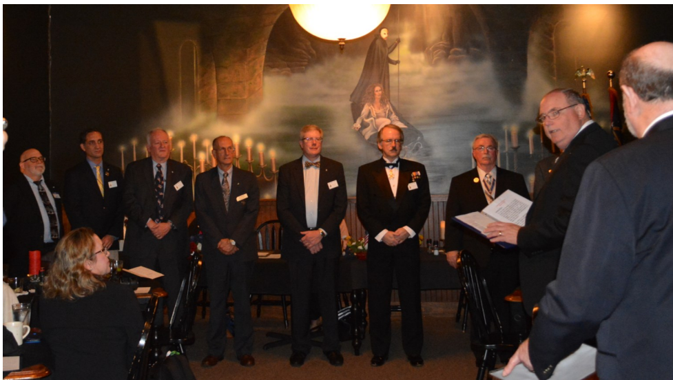
2016 Officers of the Robert Forsyth Chapter of the SAR are called to be inducted.