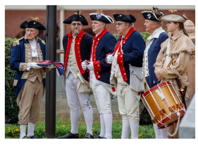
Washington Square, Kettle Creek Celebrations

Heroes of the Hornets Nest, Elijah Clark State Park