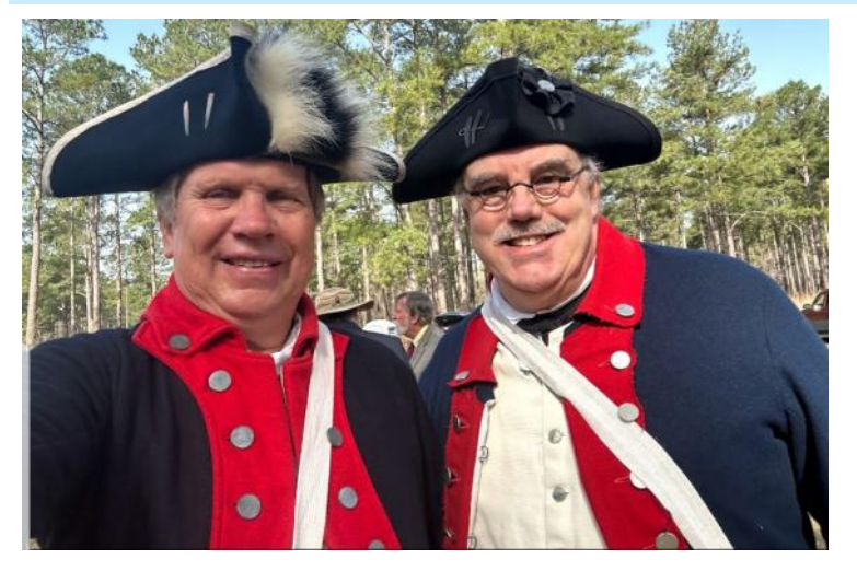
Brier Creek, Sylvania, GA