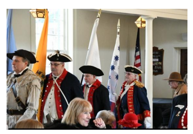
Cowan's Ford, N.C.