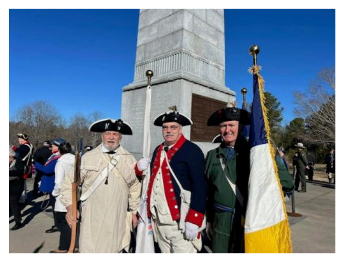
General Morgan's and Cowpens S.C.