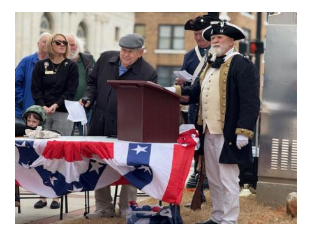
The C.A.R. even got involved with our Patriots of Liberty boys capturing a Tory sympathizer at the battle re-enactment.