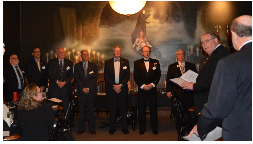
2016 Officers of the Robert Forsyth Chapter of the SAR are called to be inducted.